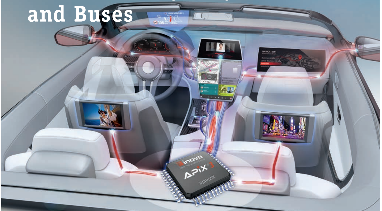
Image 1 displays APIX as copper backbone to interconnect all video systems in an automobile (image courtesy of INOVA Semiconductors).

Within the space of just a few years, the APIX (Automotive-Pixel-Link) Gigabit data highway has set new video transfer standards in the automobile industry. To date, more than 50 million implemented connections speak for themselves. VIANOVA Technologies uses the performance capacity and robustness of APIX as the core component for video transmission in trains and buses and, accordingly, offers modular infotainment systems for universal use to Public Transport Authorities (PTAs).