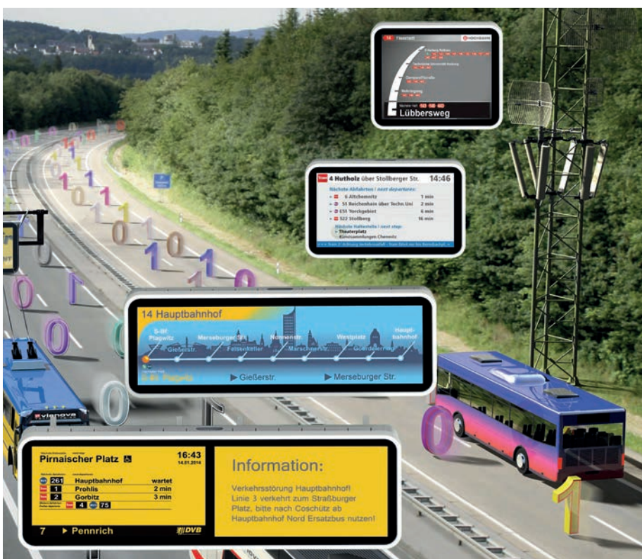
Image 2 shows the modular VIANOVA display family, all equipped with integrated server and/or APIX Gigabit data highway. (Images 2 und 3 : Vianova Technologies).

The previously described ruggedness of APIX predestines it for use