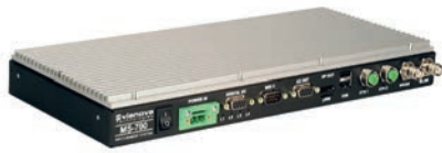
MS-700 Passively cooled vehicle server with 3rd generation GigaStar (≤ 3 Gbit/s) video outputs.

Modular onboard components combined with the flexible bitcontrol® LISA software platform create the VIANOVA Technologies turnkey infotainment solutions for use in rail or bus applications. With a choice of distributed server and intelligent display units, these units are suited for installation in all conventional vehicle types.