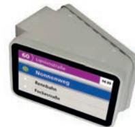
ID-18-S-W / MD-18-S-W 18.5" back-to-back display unit for wall mounting in vehicles with limited headroom.