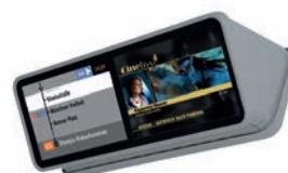
ID-18-Q-R / MD-18-Q-R 18.5" quad display unit for trams. Vehicle mounting via the enclosure.