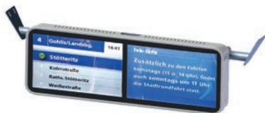
ID-18-T-R / MD-18-T-R Dual 18.5" display unit for bus installation. Vehicle mounting via stanchion.