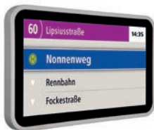
ID-18-S-U / MD-18-S-U 18.5" single display unit for entry-level passenger information.