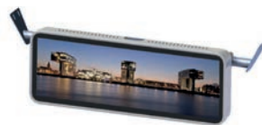
ID-29-S-R / MD-29-S-R 29" single display unit with a 32:9 format available with a variety of installation options